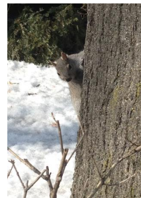
Figure 1: A Squirrel in Campus

Living in MIT is totally different from living in CUHK. On my arrival at MIT, I was amazed how the buildings in main campus are connected to each other. Back in CUHK, we have to go uphill and down dale or even take buses from class to class. But in MIT, you do not even need to walk into the chilly winter outdoors. The buildings, though connected, are in completely different style. There are traditional buildings like Memorial Lobby and modern but wired buildings like the famous Stata. When spring comes, I would rather walk outdoors than indoors. Trees are covered with bloom and small animals are around the campus. I began to jog along the Charles River every other day in late spring. And every sunset I saw is hauntingly beautiful and wonderfully heartbreaking.